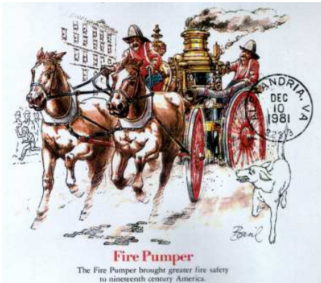
Fire Pumper The Fire Pumper brought greater fire safety to nineteenth century America.

- How do thematic collectors choose a topic to fill their